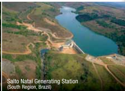
Salto Natal Generating Station (South Region, Brazil)