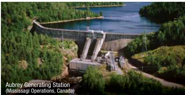
Aubrey Generating Station (Mississagi Operations, Canada)

Our renewable power assets are unique in nature and generate electricity from clean sources with virtually no greenhouse emissions or pollution. Brookfield Renewable Power's operations are focused on health and safety, the environment, and preserving the value of our renewable assets for the long-term.