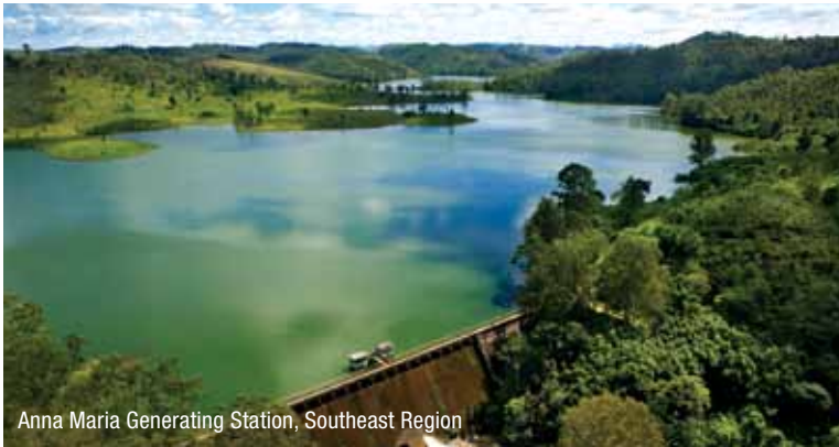
Anna Maria Generating Station, Southeast Region