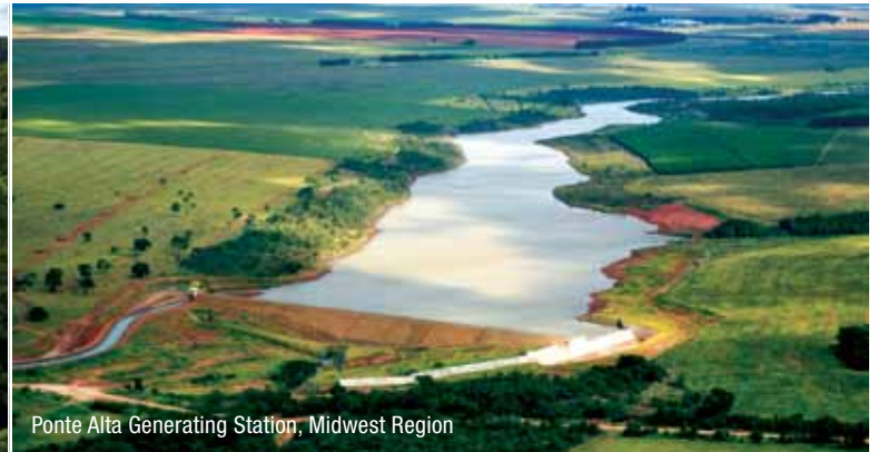
Ponte Alta Generating Station, Midwest Region