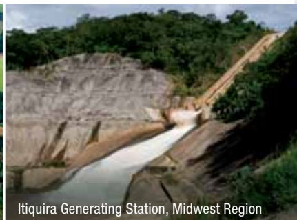
Itiquira Generating Station, Midwest Region